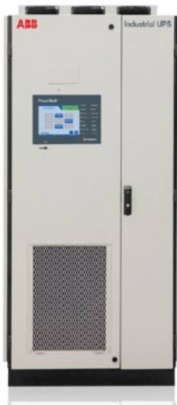
Cyberex® PowerBuilt™ Industrial UPS